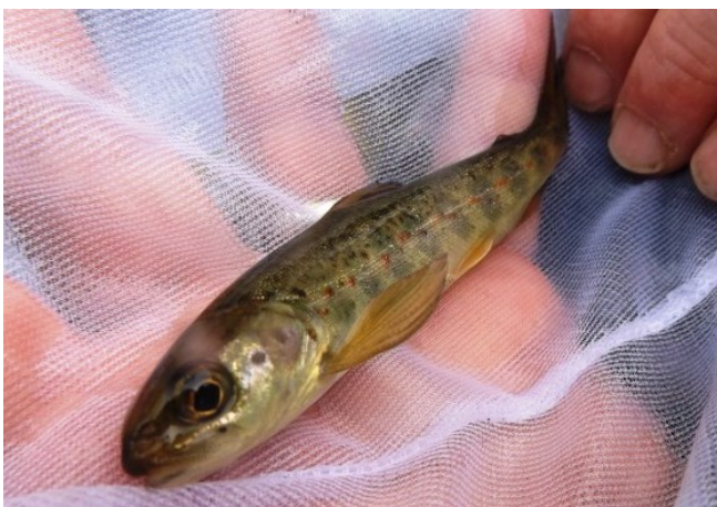
A fin-clipped salmon pre-smolt from the Tommore Burn trap. This one has been fin-clipped to identify it as originating from the SFB Hatchery.