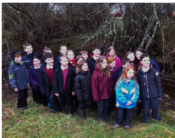
Above: Knockando primary P5-7 class after releasing their salmon

Knockando primary were the first to release their eggs into the Knockando burn, closely followed by Cullen primary who