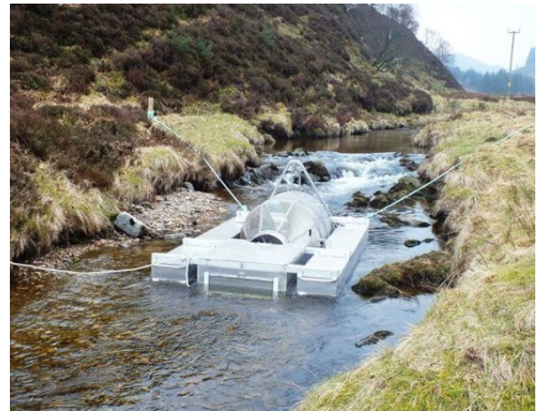
Above: The River Fiddich Trap secured into position and operational