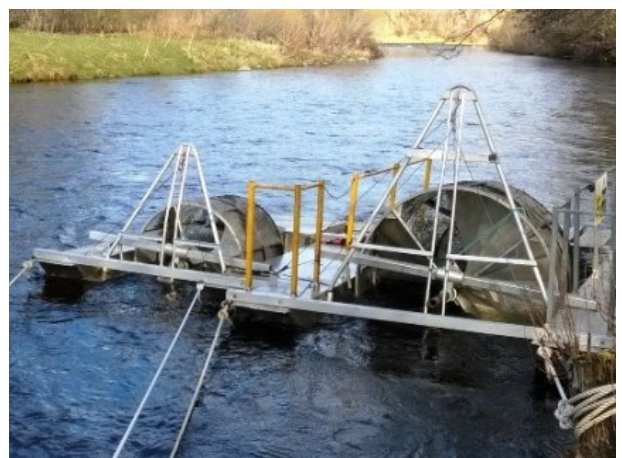
4 ft and 6 ft Smolt Traps in position again on the River Avon