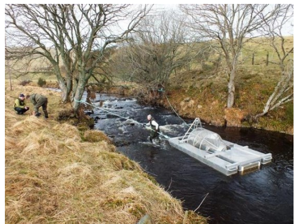
Above Left: The Deveron and Spey Team working together to secure the Allt Deveron Trap. The Upper Deveron has very good habitat with a good catch of salmon smolts last spring.