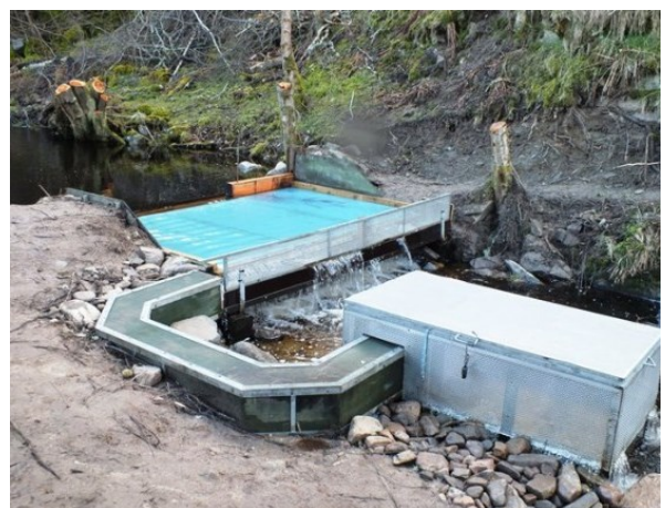
Tommore Burn Smolt Trap installed and operational