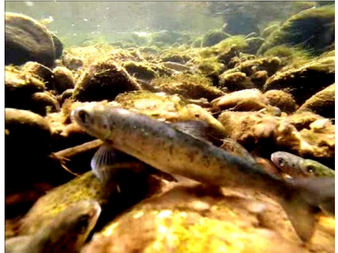
Photo of salmon smolts

The pilot project will provide vital information about the timing and speed of their migration, where they are delayed and when, and hopefully why some are lost. The Spey is an idea river for this study; it is not only a major salmon river, but one with a long history of smolt research, and could become a valuable index tracking site.